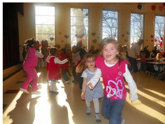
Fun at the Valentine Day Party