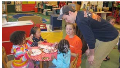
Alpha Phi Omega Sponsor a Valentine Party