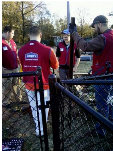
Lowe's Heroes Workers Install Fence around Raised Garden Beds